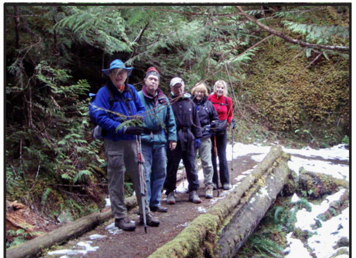
A recent hike on Lower Big Quilcene hike on April 9th with snow on the ground!

and information, contact Allen Vaa at allenvaa@hotmail.com . Hikes are usually on Wed. at 9am but longer hikes can start at 8am so you will need to check for different start times.