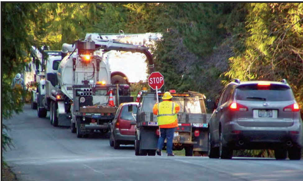
Small armada of utility equipment responding to failing underground electrical cables on Kala Point Drive.

conductors. Plastic insulation on the heavy copper and aluminum primary cables, each carrying as much as 13.2 Kilo-Volts (KV), simply wears out over time in contact with soils, and heat stressed with more and more connected homes.