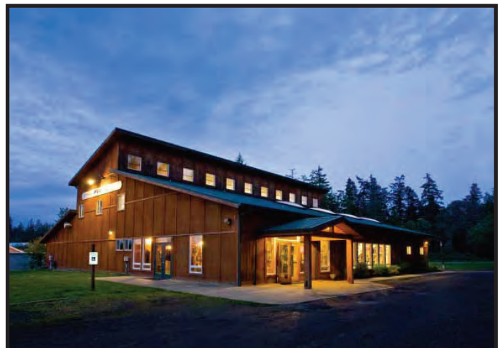
Evergreen Fitness Center, near Old Fort Townsend State Park - "a stones throw away".

So, welcome, 2009, but this year, instead of just making a resolution that fades in 3-6 weeks, choose to make a life style change by incorporating exercise 3 days a week. Stress will always come into our lives; and exercise is one healthy way to overcome it. Take 2009 and make your health a priority.