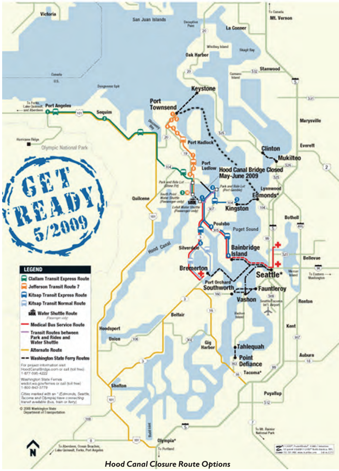
Hood Canal Closure Route Options

In order for people from Kala Point to use the water shuttle they will either drive to the park and ride lot at Shine and take the bus to the ferry or they can catch the bus from Port Townsend which will drop them off at the ferry dock at South Point. The bus stops are: Port Townsend Park and Ride, 4 Corners, Jefferson County Library (Hadlock), Port Hadlock QFC, Oak Bay and Olympus, Port Ludlow and Breaker Lane, and the Gateway Visitor Center. Parking appears to be very limited except at the Port Townsend Park and Ride and the Shine Park and Ride.