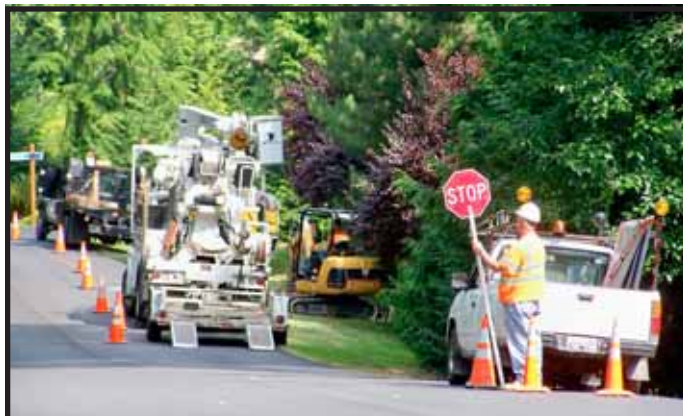
12-Hour PSE Partial Kala Point Blackout on Aug 15th. Vehicles & Repair Equipment lined up Kala Point Dr. blocking one lane.

The second extended electrical blackout in as many years left 73 Kala Point Homes without PSE electrical service from 1:35 Friday Morning, August 15th, until nearly two that afternoon. Since the cable TV system (but not telephone infrastructure) requires