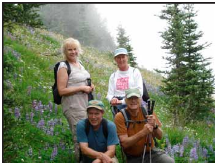
Wildflowers in full bloom on the Deer Park hike in August.