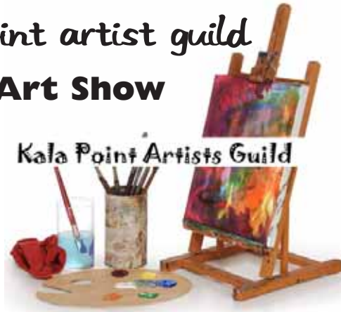
Kala Point Artists Guild