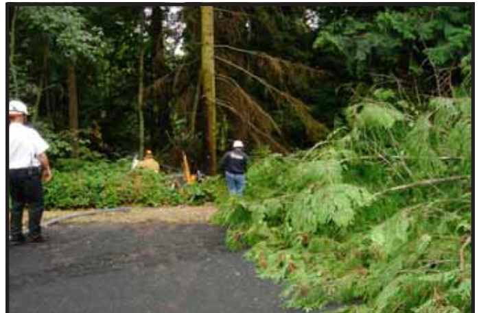
Crash site on Kala Point Drive.

Mooyman, of 11 Shorecrest Place , was, according to fire personnel, thought to have likely suffered from a medical incident while driving, leading to the crash as she lost control of the vehicle.