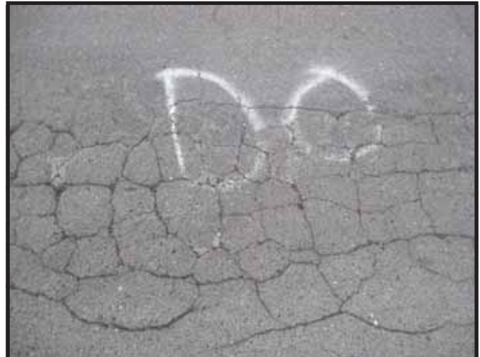
Typical markings on Kala Point roads that have been identified as needing repair.

are largely dedicated to paving replacement. Replacement costs, however, have escalated to historic levels with the rapid rise in oil prices.