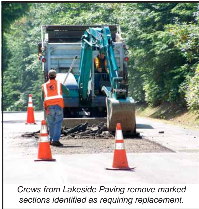
Crews from Lakeside Paving remove marked sections identified as requiring replacement.

Piecemeal asphalt pavement patching, part of the estimated $1.5 Million Dollars in deferred and previously un-funded street repairs identified in an independent reserve study last year, have been undertaken on KP Drive and Terrace Drive.