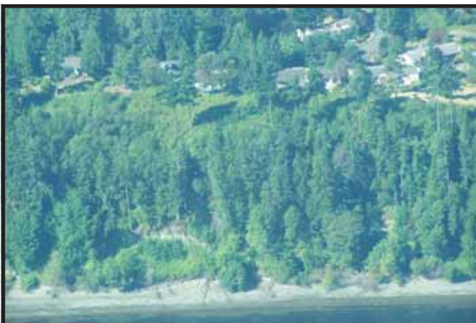
Many Large Trees! Kala Heights Drive bluffs - 2006

What is wrong with the concept to top the tall trees on the bank at least near the top of the bank? That approach would contribute to bank stability and also address the continuing contentious issue of view maintenance. Is the current “touch no tree” mantra of some of the Kala Point owners going to prevail until the community experiences a disaster that could have been prevented or at least ameliorated?