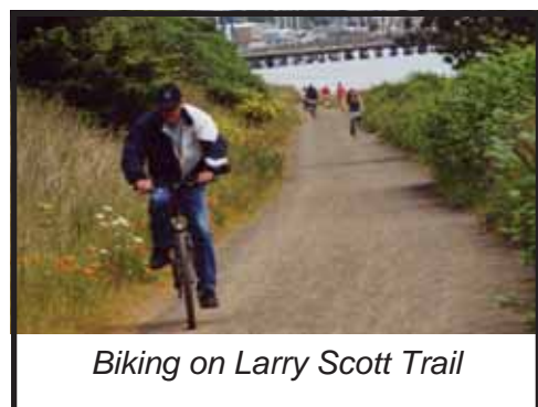
Biking on Larry Scott Trail

Old Fort Townsend State Park, as well as the Larry Scott Memorial trail. We'll stop at the Blue Moose