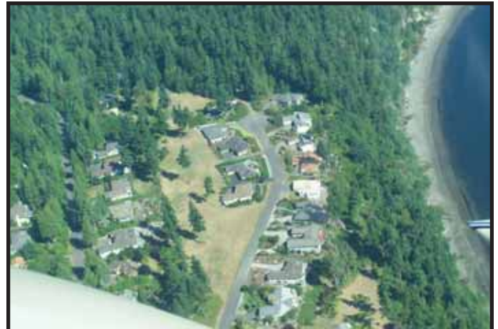
Aerial view of Kala Heights Drive bluffs - 2006

exacerbated the situation. Logic says that a massive weight, toppling over and sliding down hill has got to be a contributor to the extent and magnitude of the earth movement.