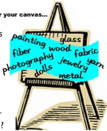
Kala Point Artists Guild