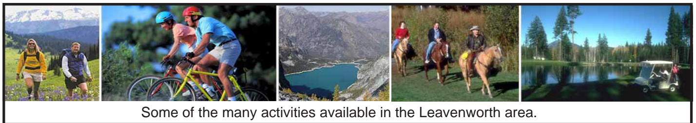
Some of the many activities available in the Leavenworth area.

Come and enjoy the wide variety of activities and camaraderie! For more information, contact Allen Vaa at 536-1822 or allenvaa@hotmail.com .