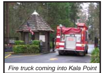
Fire truck coming into Kala Point

An annual inspection , however, is a must to assure safety. Having your chimney professionally cleaned and inspected is recommended at least every other year. See ad on page 11.