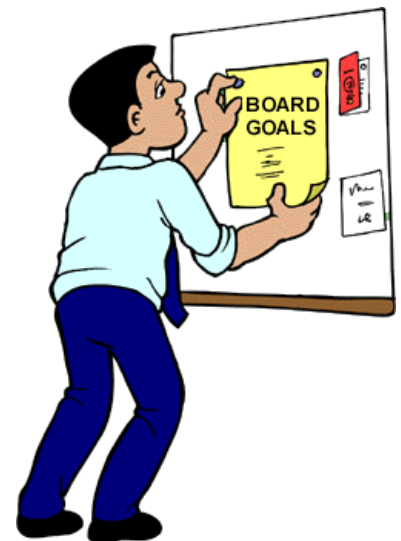
Table IIA following is a succinct summary of the main points made with regard to Board goals. It is organized by the 12 topic headings and by descending order of number of member replies. It also lists the main points made by members for Board Goals associated with each topic heading. Reading Table IIA enables a reader to get a quick grasp of the overall sense of member comment on Board Goals.

It is worth noting that each comment is from a single individual. The Board goal listed is a reflection of both the kind and the priority of that goal to that individual.